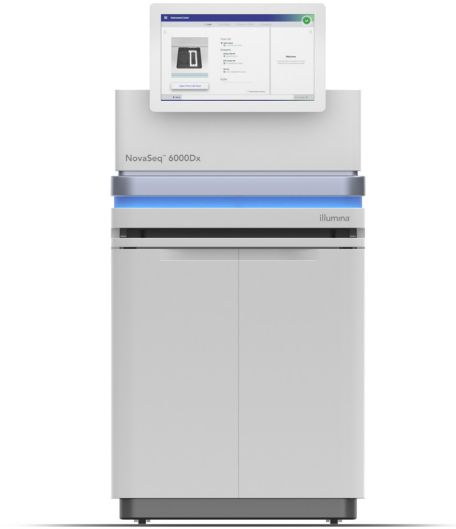
Figure 1: The NovaSeq 6000Dx instrument—With a unified user interface that enables seamless control of both IVD and RUO Modes and a dedicated DRAGEN Server for accelerated data analysis, the NovaSeq 6000Dx instrument delivers high-quality results for both clinical and research applications.