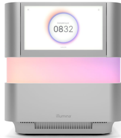
Figure 1: The NextSeq 2000 Sequencing System—The NextSeq 2000 system offers innovative design features, advanced chemistry, simplified bioinformatics, and an intuitive workflow that enable the widest range of applications and flexibility of scale on a benchtop sequencing system.

The NextSeq 1000 and NextSeq 2000 Sequencing Systems leverage the latest advances in optics, instrument design, and reagent chemistry to miniaturize the volume of the sequencing reaction while increasing output and reducing the cost per run. Now, users can obtain the throughput, data quality, and cost required to meet their needs, from smaller batch sizes and lower throughputs,