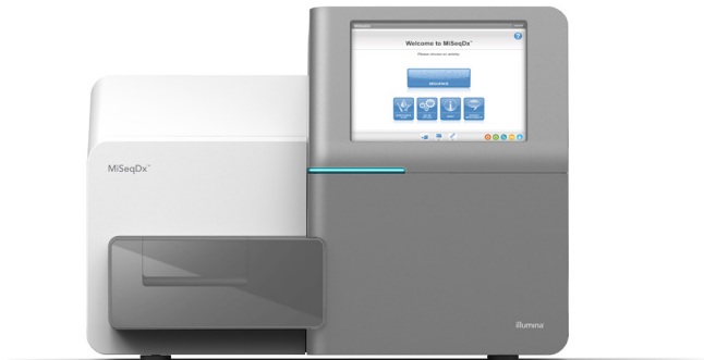
Figure 1: MiSeqDx Instrument—The FDA-regulated, CE-IVD–marked MiSeqDx Instrument offers a simple workflow, user-friendly software interface, and enhanced user security.

The MiSeqDx Instrument is the first Food and Drug Administration (FDA)–regulated and Conformité Européenne in vitro diagnostic (CE-IVD)–marked platform for next-generation sequencing (NGS) (Figure 1). Designed specifically for the clinical laboratory environment, the MiSeqDx Instrument offers a small footprint (0.3 square meters), an easy-to-use workflow, and data output tailored to the diverse needs of clinical labs. In addition, the on-instrument integrated software enables run setup, sample tracking, user management, audit trails, and results interpretation.* Taking advantage of proven Illumina sequencing by synthesis (SBS) chemistry, the MiSeqDx Instrument provides accurate, reliable screening and diagnostic testing.